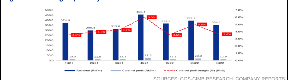
Figure 1: Senheng's quarterly financial trend